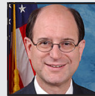
Narendra Modi Prime Minister of India

"Those who think they can keep Pakistan together by attacking other cultures with jihadist extremism, should visit Dhaka."